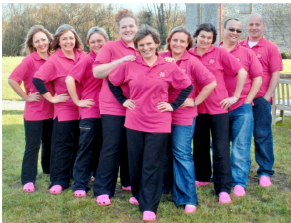
Friends & Family involved in the Charity