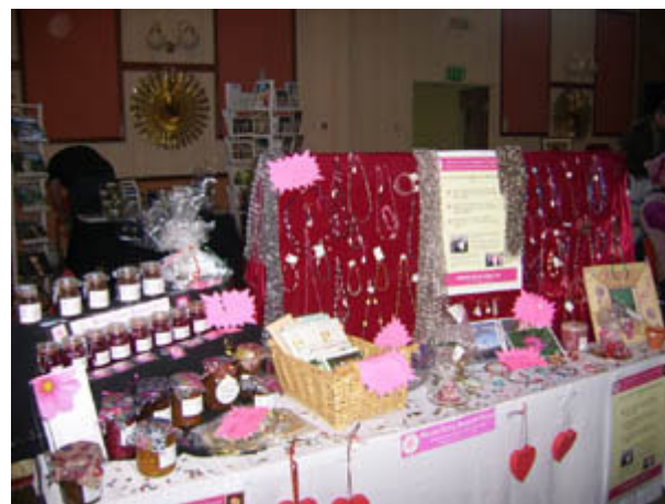
NCSF Craft Stall